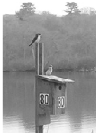
Tree swallows have taken up residence in songbird house #80, which boasts a scenic location on the banks of the Carmans River.